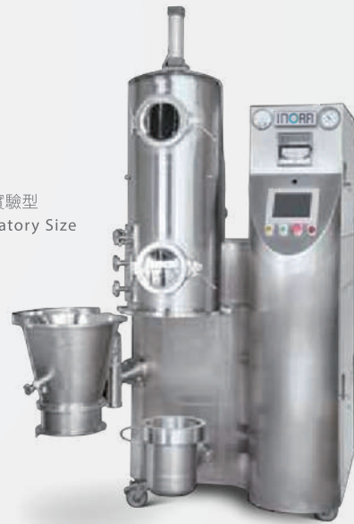
實驗型 Laboratory Size