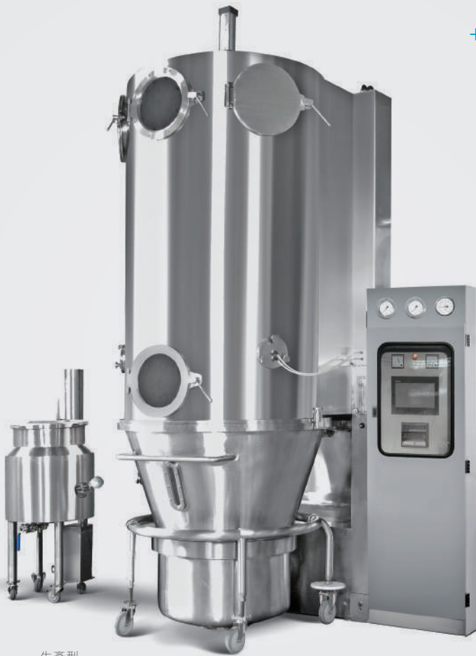
生產型 Production Size